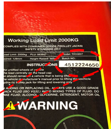
SCA Hydraulic Trolley Jack 2000kg Sold at Supercheap Auto stores from 25/10/2019 to 3/7/2020.

Product Description: Trolley jack in red colour. PLU 563847. The batch number is located on the top of the lift arm assembly. Only batches with the following batch numbers: